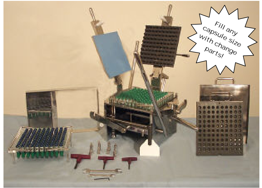
The ideal machine for new products, small runs, new manufacturers. Scenes from our on-line video (www.torpac.com/vhf_videos.htm) are on the reverse.

"Impressive quality and craftsmanship, .... easy to use." Plum Creek Pharmacy